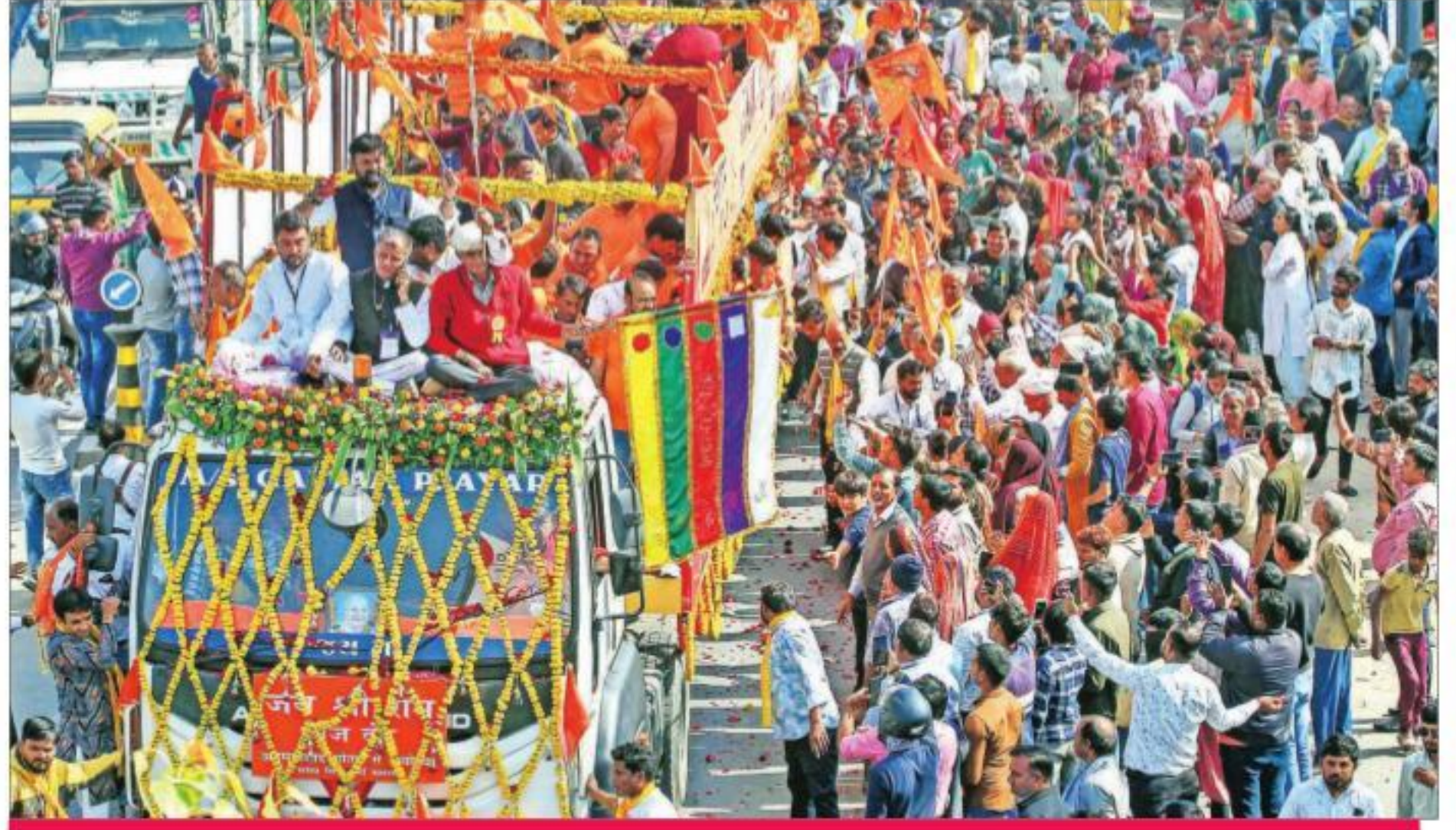
Devotees take part in a procession in Ahmedabad on Friday as they transport a flag pole to be put up at Ayodhya's Ram Temple.